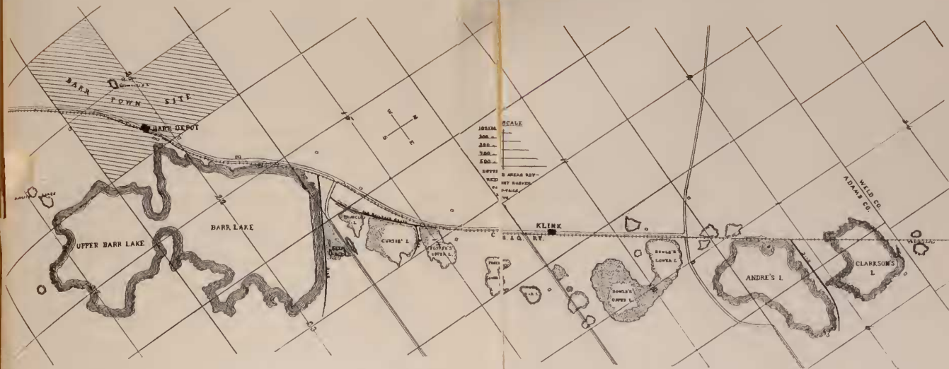
SKETCH MAP OF THE BARR LAKE CHAIN.